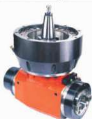
AUTO-90-DEGREE-INDEXING HEAD BT-50